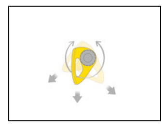
The COEUR hanger can rotate once installed and when laterally loaded during use, allowing it to better align with the systems in place.